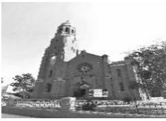
St Marys Church Bairnsdale

BAIRNSDALE – OMEO East Region – Diocese of Sale Who we are tomorrow begins with what we do today.