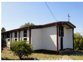
St Francis of Assisi Benambra