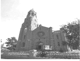
St Mary's Bairnsdale