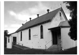
St Patrick's Painesville

Who we are tomorrow begins with what we do today.