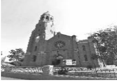
St Marys Church Bairnsdale