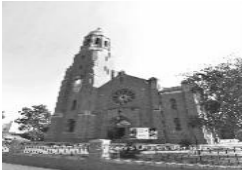
St Marys Church Bairnsdale

BAIRNSDALE – OMEO East Region – Diocese of Sale Who we are tomorrow begins with what we do today.