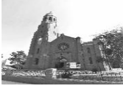
St Marys Bairnsdale

BAIRNSDALE – OMEO East Region – Diocese of Sale Who we are tomorrow begins with what we do today.