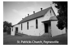
St Patricks Paynesville

Vision: We are a welcoming community where the word of God, through the message of Jesus Christ is made known & lived. Our mission is to: Live the message of Jesus Christ taking inspiration from Mary, the Mother of God. Empower our community to activate their gifts to build a better world. Strengthen and grow our faith.