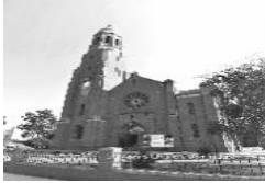
St Marys Bairnsdale