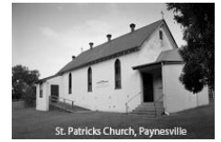
St Patricks Paynesville

Vision: We are a welcoming community where the word of God, through the message of Jesus Christ is made known & lived. Our mission is to: Live the message of Jesus Christ taking inspiration from Mary, the Mother of God. Empower our community to activate their gifts to build a better world. Strengthen and grow our faith.