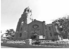
St Marys Bairnsdale