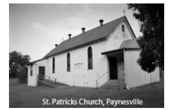
St Patricks Paynesville

Vision: We are a welcoming community where the word of God, through the message of Jesus Christ is made known & lived. Our mission is to: Live the message of Jesus Christ taking inspiration from Mary, the Mother of God. Empower our community to activate their gifts to build a better world. Strengthen and grow our faith.