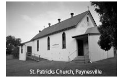
St Patricks Paynesville

Vision: We are a welcoming community where the word of God, through the message of Jesus Christ is made known & lived. Our mission is to: Live the message of Jesus Christ taking inspiration from Mary, the Mother of God. Empower our community to activate their gifts to build a better world. Strengthen and grow our faith.