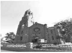
St Marys Bairnsdale