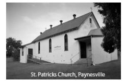
St Patrick's Paynesville

Vision: We are a welcoming community where the word of God, through the message of Jesus Christ is made known & lived. Our mission is to: Live the message of Jesus Christ taking inspiration from Mary, the Mother of God. Empower our community to activate their gifts to build a better world. Strengthen and grow our faith.