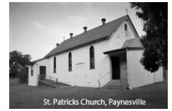
St Patricks Paynesville

Bairnsdale – OMEO East Region – Diocese of Sale Who we are tomorrow begins with what we do today.