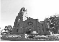
St Marys Bairnsdale

Bairnsdale – OMEO East Region – Diocese of Sale Who we are tomorrow begins with what we do today.