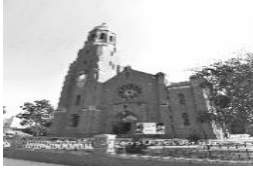
St Marys Bairnsdale