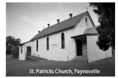
St Patricks Paynesville

Vision: We are a welcoming community where the word of God, through the message of Jesus Christ is made known & lived. Our mission is to: Live the message of Jesus Christ taking inspiration from Mary, the Mother of God. Empower our community to activate their gifts to build a better world. Strengthen and grow our faith.