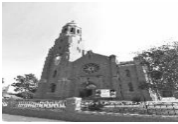
St Marys Bairnsdale