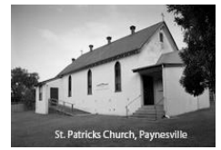
St Patricks Paynesville