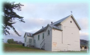
Sacred Heart, Swifts Creek