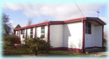
St Francis of Assisi, Benambra