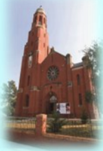
St Mary's Bairnsdale