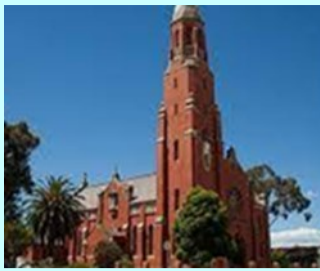
St Mary's Bairnsdale