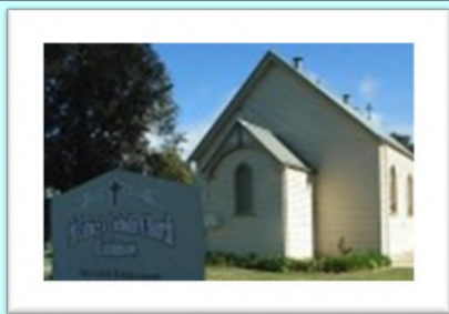
St Canice's, Lindenow