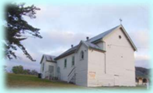
Sacred Heart, Swifts Creek