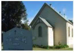
St Canice's, Lindenow