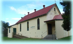
St Patrick's Paynesville