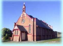
Immaculate Conception, Omeo