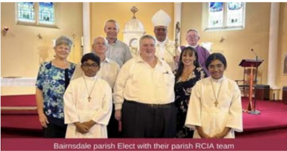
Bairnsdale parish Elect with their parish RCIA team