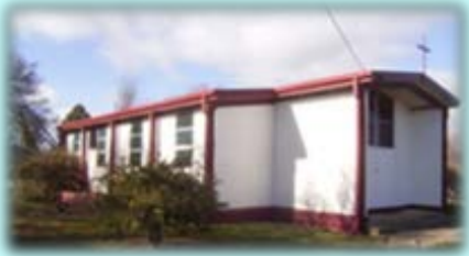
St Francis of Assisi, Benambra