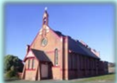
Immaculate Conception, Omeo