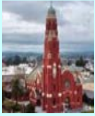
St Mary's, Bairnsdale