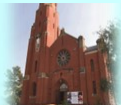
St Mary's Bairnsdale