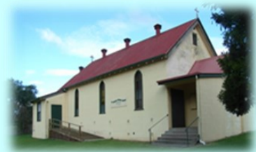
St Patick's Paynesville