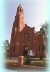
St Mary's Bairnsdale