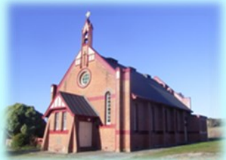
Immaculate Conception, Omeo