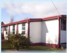
St Francis of Assisi, Benambra