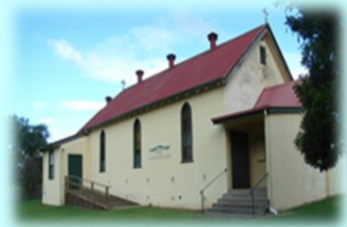
St Patrick's, Paynesville