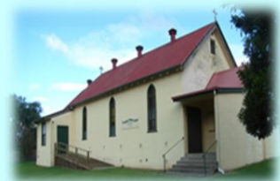
St Patrick's, Paynesville